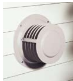
▲ STANDARD DIRECT-VENT CAP MOUNTED ON OUTSIDE WALL