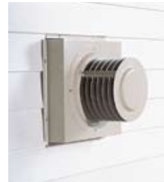
▲ VINYL SIDING VENT KIT ACCESSORY FOR DIRECT-VENT UNITS