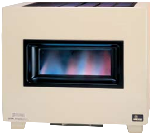
▲ RH-50B Visual Flame Heater (Vent Pipe Not Shown, Heater Must Be Vented)

Radiant and convection heat circulates the warmth while the blower (optional on the RH-50C and RH-65C) places warm air at floor level to give "barefoot" comfort throughout the winter season. The hydraulic thermostat needs no outside electricity assuring reliable, round-the-clock comfort. Each unit can be installed near any wall with access to a conventional vent.