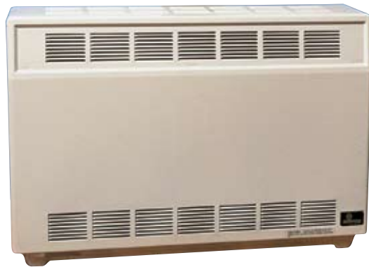
▲ RH-35 (Vent Pipe Not Shown, Heater Must Be Vented)

Ideal for medium to large rooms, each unit can be installed anywhere there is access to a vent. Housed in a durable, textured, powder-coated, beige cabinet, these room heaters look as good as they work for years.