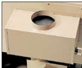
Draft diverter may be rotated for horizontal or vertical installations.